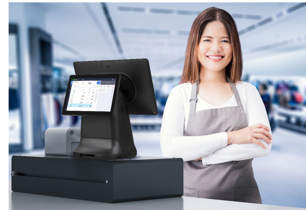
Option 3: Main screen 15.6" (For Cashier) + Secondary screen 10.1" (For Customer)