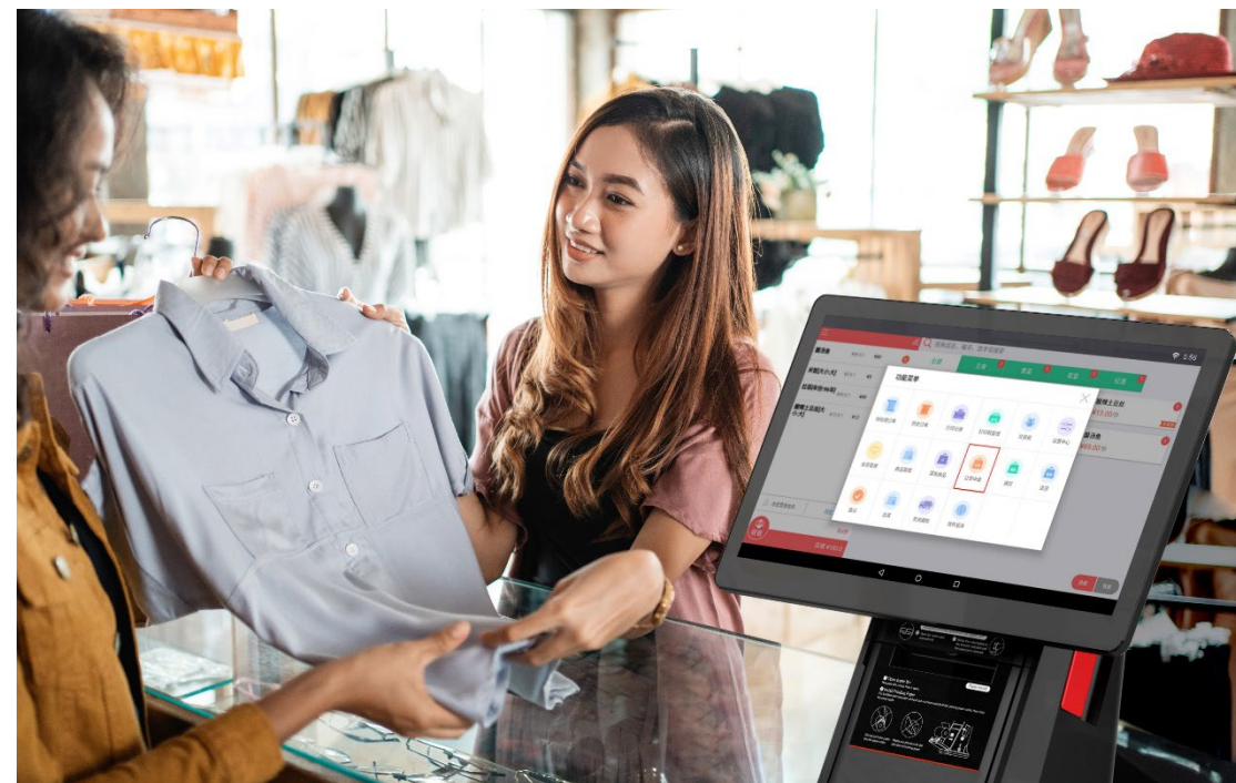
Option 1: Single screen 15.6"