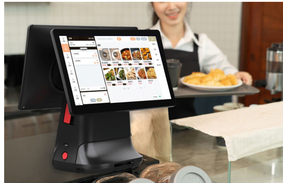
Option 2: Main screen 15.6" (For Cashier) + Secondary screen 15.6" (For Customer)